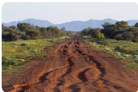
On the Binns Track looking towards Harts Range