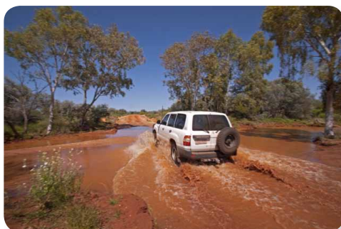
A high clearance 4WD is recommended. The usually dry roads may be impassable after rain