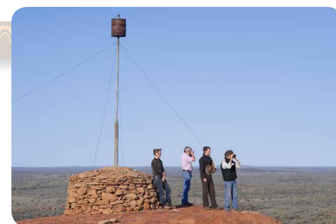
A pair of binoculars and a sturdy pair of shoes are a must for visitors planning to explore all the Reserve has to offer

Bush camping, nature observation and bushwalking can all be enjoyed within the Reserve. Sunrise and sunset provide spectacular opportunities for photography. A visit to nearby Mt Swan is a must, with a renowned art gallery displaying Utopian Art. They also provide B&B style accommodation for visitors who enjoy a little more luxury. The adventurous traveler can continue on to the many other attractions the Binns Track has to offer.