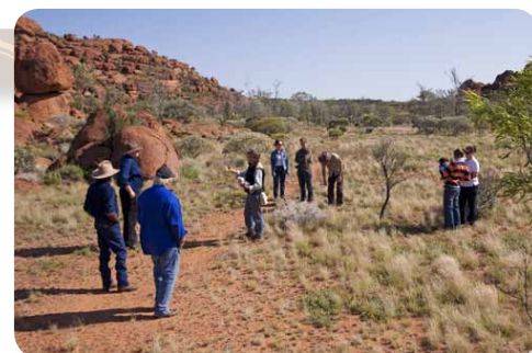
Station owners, scientists and volunteer groups are working together to document the Reserve's biodiversity values

The 474 hectare Mac and Rose Chalmers Conservation Reserve supports a diverse range of plants and animals, including a number of threatened species. It is part of the Burt Plain Bioregion, known for some of Australia's most extensive mulga woodlands. The granite boulders are the most striking geological feature of the Reserve, providing refuge for the areas inhabitants.