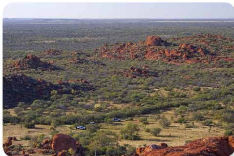
Spectacular views of the Reserve await those who climb the boulders up to Tower Rock